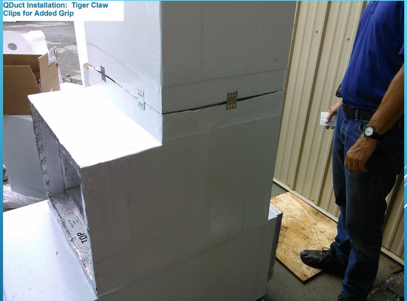
QDuct Installation: Tiger Claw Clips for Added Grip