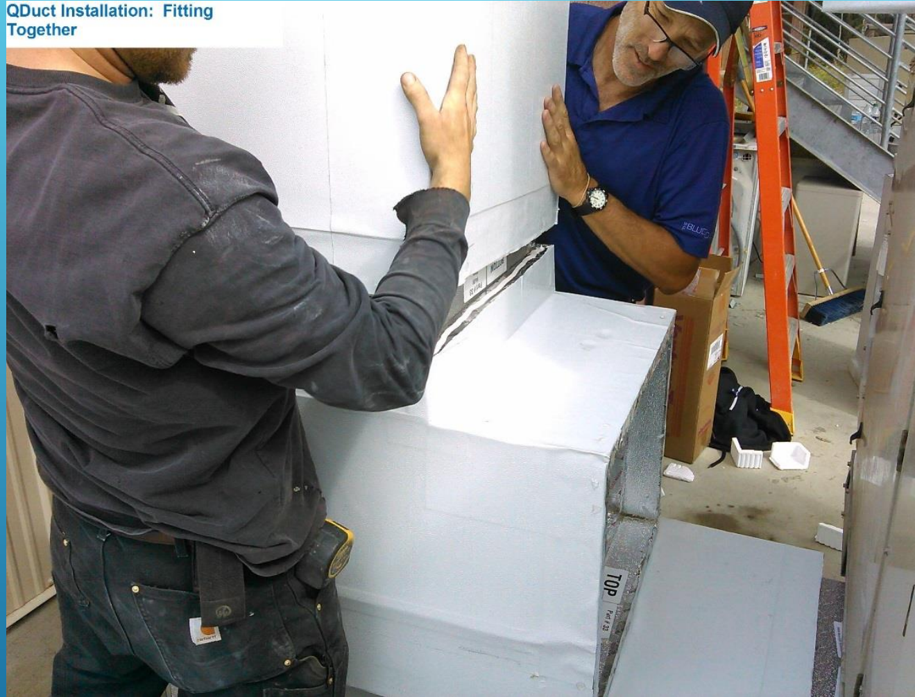
QDuct Installation: Fitting Together