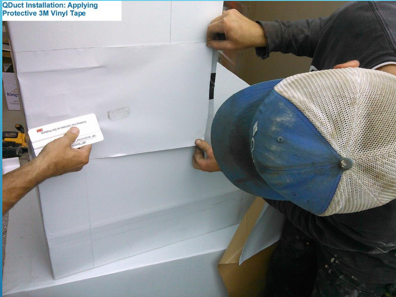
QDuct Installation: Applying Protective 3M Vinyl Tape