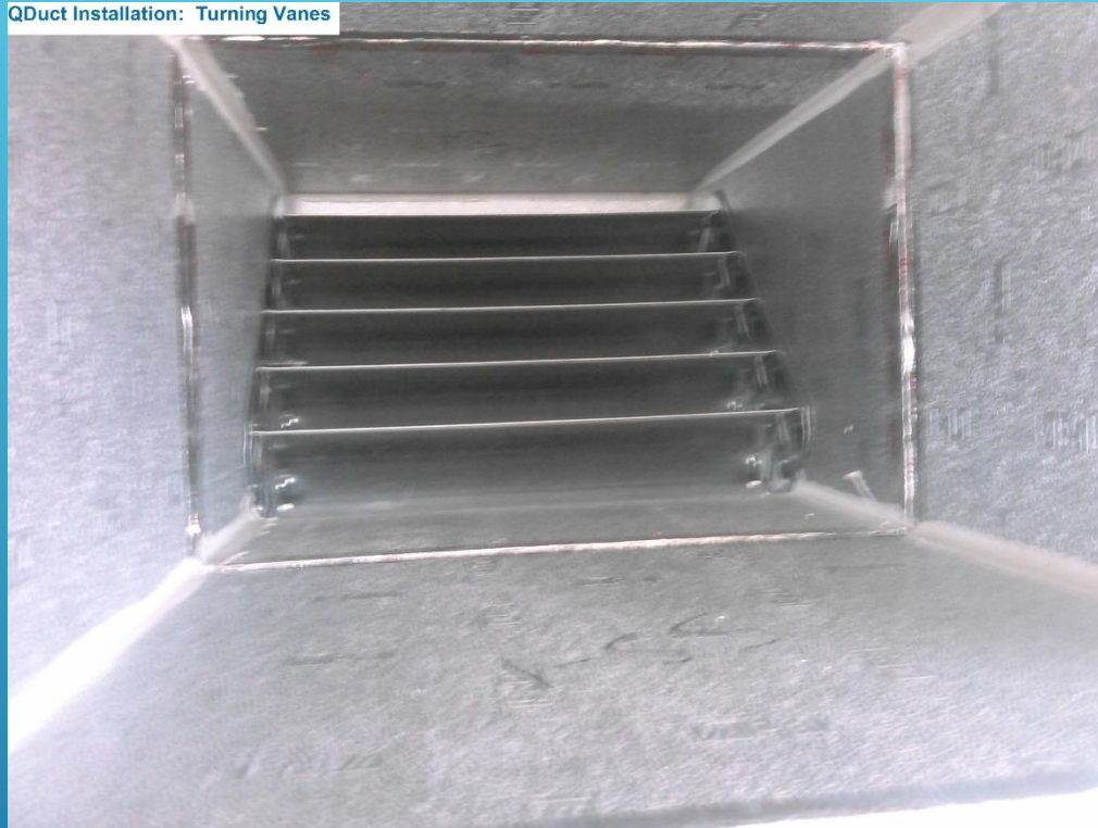
QDuct Installation: Turning Vanes