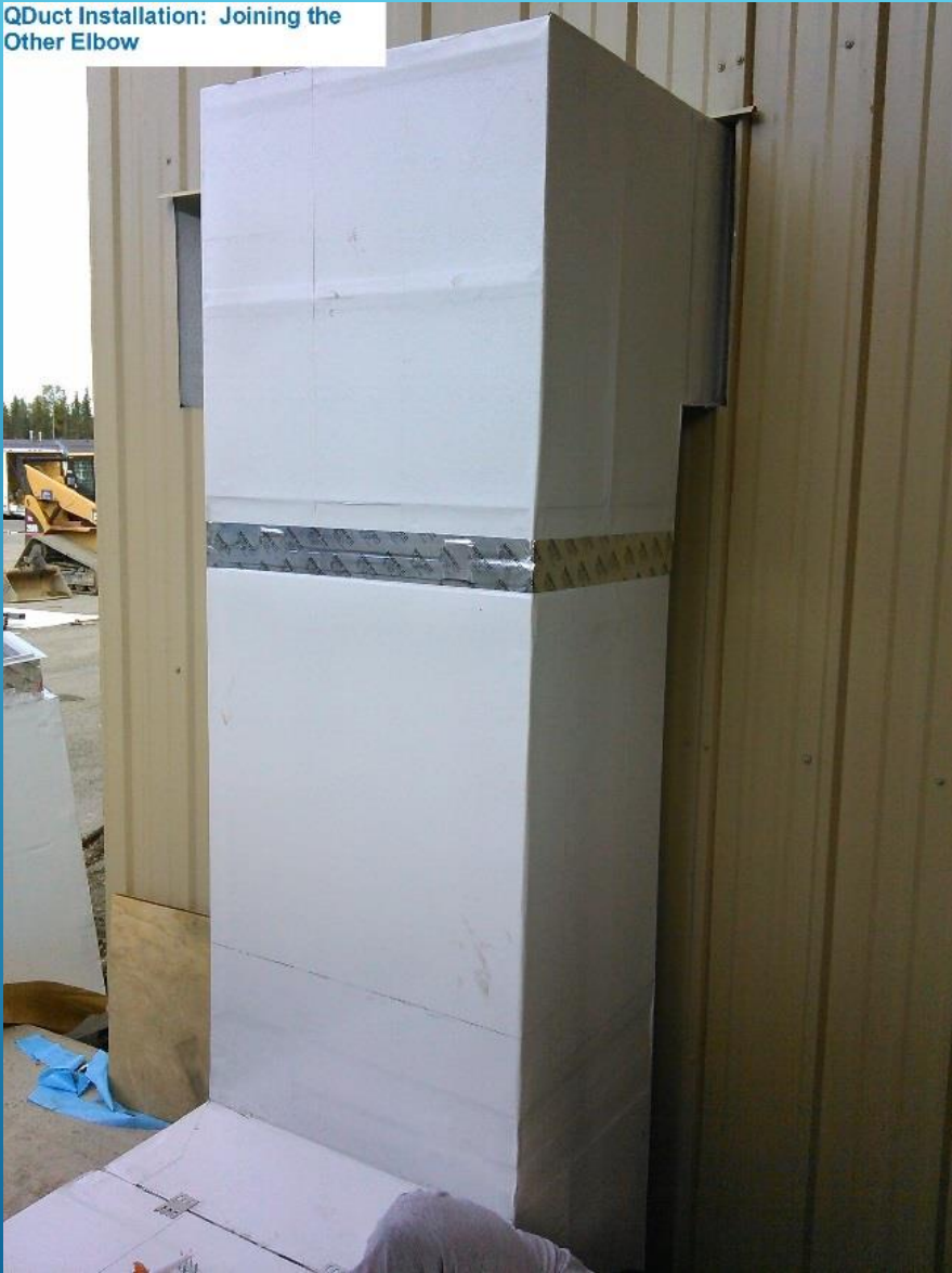
QDuct Installation: Joining the Other Elbow