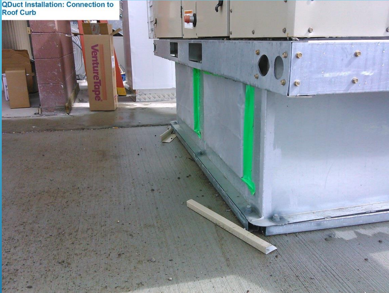
QDuct Installation: Connection to Roof Curb