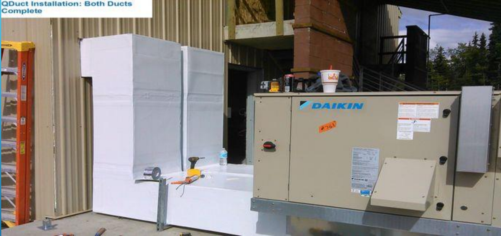
QDuct Installation: Both Ducts Complete