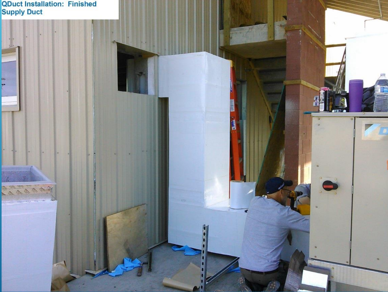
QDuct Installation: Finished Supply Duct