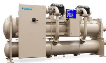
WMC 145 to 400 Ton 55 Units Available