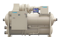
WSC 400 to 700 Ton 9 Units Available