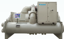
WME 500 and 700 Ton 4 Units Available