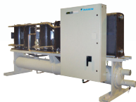
WGZ 40 to 200 Ton 26 Units Available